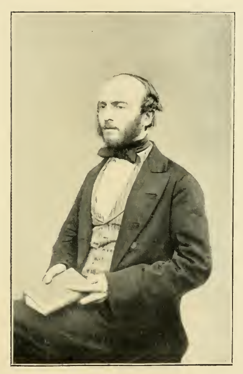
CHARLES BAGOT CAYLEY. From a Photograph, c. 1866. To face p. 142.